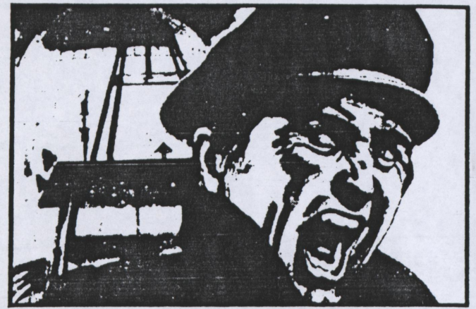
Fourth encounter... tuna fishers see the UFO 150 miles out at sea