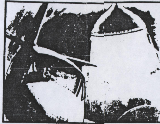
Thirty minutes later... the craft is sighted again by a pilot